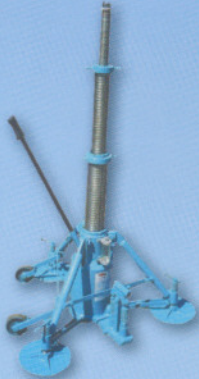
VTEJ-5/665 TELESCOPIC JACK-3 STAGE WITH WHEELS AND STABILIZERS AND INTEGRAL PUMP

The air corridors of the Indian sky are frequented by a host of National and International airlines bringing countries closer everyday. Indian Air Force's expanding fleet of several diverse types and sizes of aircrafts keep an ever watchful vigil over the country's frontiers. Air India, Indian Airlines and private ATO, using an equally mixed fare of flying machines, turn the vast spaces between the far flung cities of this subcontinent into hailing distances.