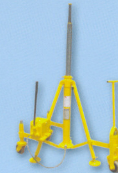
VAJ-15/787 SINGLE STAGE JACK WITH WHEELS AND STABILIZERS AND DOWTY PUMP